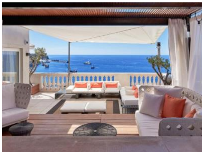
PICS OF RESIDENCE