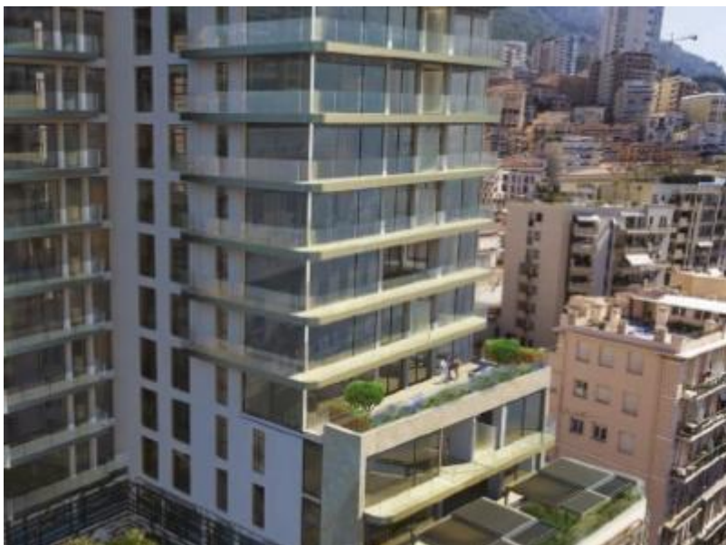
PICS OF RESIDENCE