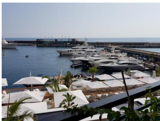
PICS OF RESIDENCE