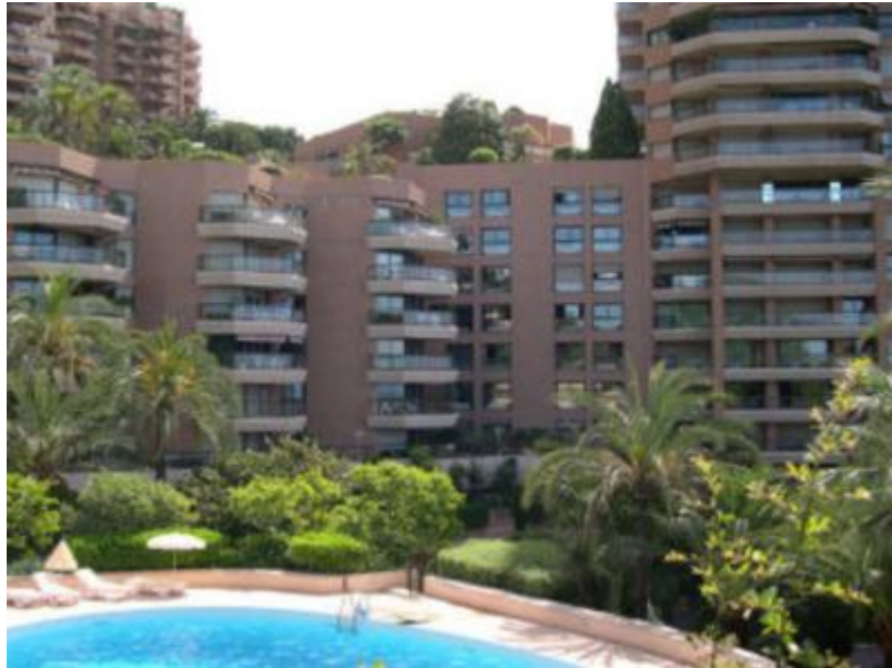
PICS OF RESIDENCE